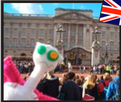
Buckingham Palace