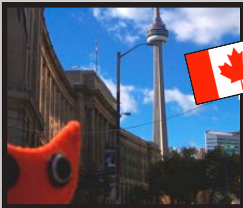
CN Tower