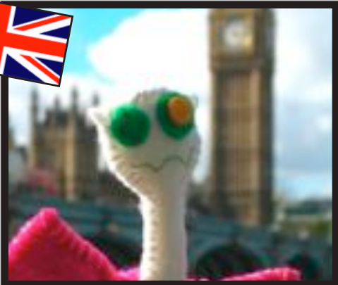
Big Ben