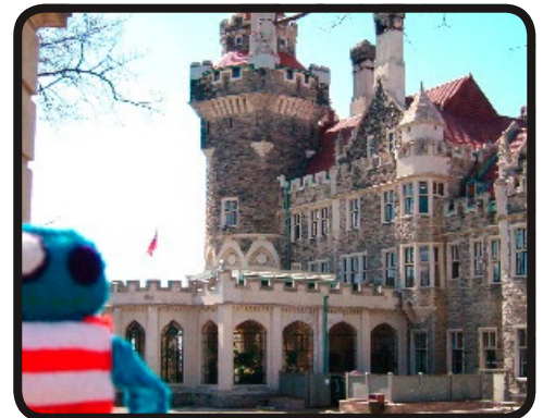
"Yes, baby, this is my crib but it's the maids day off, so I don't want to let you in. How 'bout we go back to your place..." (Bump-a-Gump at Casa Loma).