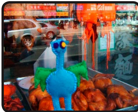
Holy Squid! Barrel Roll visits Chinatown.