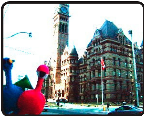
Barrel Roll and Elly in front of a very-old-important-looking building (old City Hall).